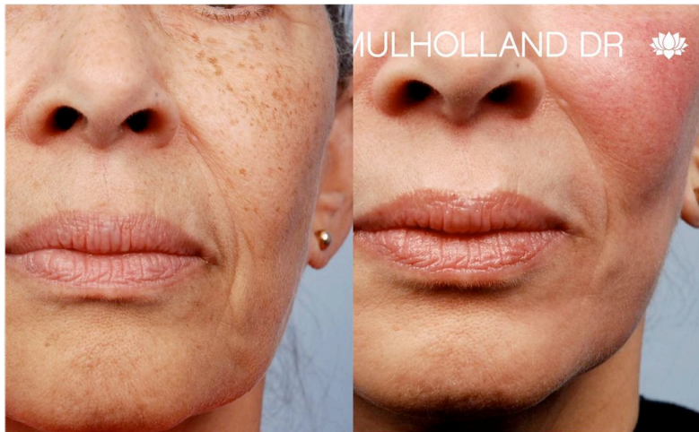
Figure 4 - Female patient before the treatment and 64 months after a single full face treatment