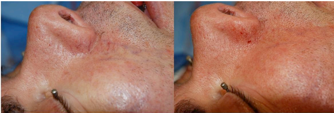
Figure 5 - Nasal spider vessels before and immediately after Fractora treatment